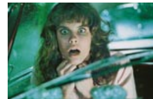
Left Arnie's girlfriend Leigh Cabot (Alexandra Paul) gets all choked up in Christine .