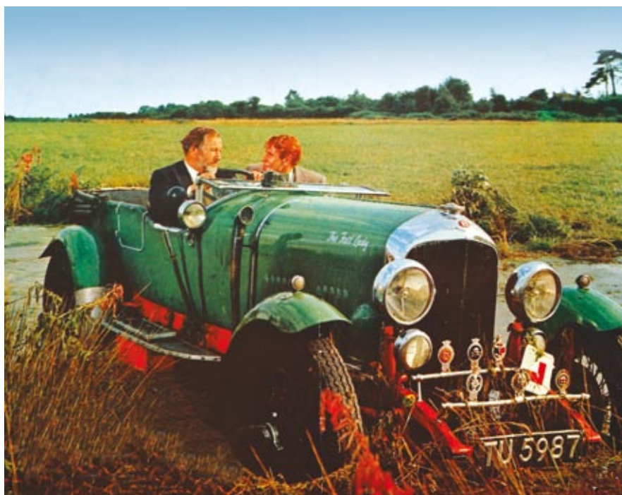
Above Bentley 3 Litre was the eponymous Fast Lady, piloted here by the irascible James Robertson Justice.