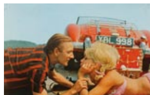
Left Smooth-talking Leslie Phillips uses MGA to impress Julie Christie in The Fast Lady .

After filming was completed, the Bentley was offered to Phillips for £900, which the actor was obliged to turn down. The same car recently changed hands for a modest six-figure sum.