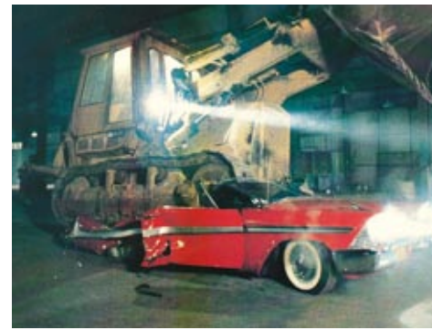
Left and below Christine, the '58 Plymouth Fury, meets her match; a tense moment in Checkpoint , 1956.

The 'Warren-Ingrams' headed towards the drink in the final scene was a glassfibre mock-up and both Lagondas survive to this day. As for the Fairthorpe Atoms, they are the supposedly top-secret Italian racing prototypes that arch-fiend Stanley Baker is attempting to steal.